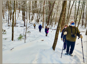
Fuller Forest Preserve