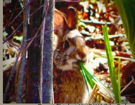
Great Thicket Nat'l Wildlife Refuge