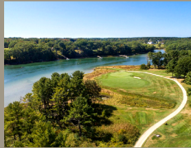
York Golf and Tennis Club

Since the beginning of 2020, partners within the Mt. Agamenticus to the Sea Conservation Initiative have preserved more than 540 acres in southern Maine, including a working forest; farmland; river frontage that protects drinking and swimming waters; and more than 370 acres of public access land. Many of these projects came about through close collaboration with our partners and community members. Learn more about our ambitious efforts in the Project Highlights below.